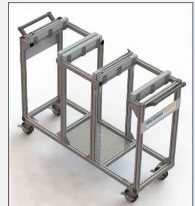
Mighty Max 3