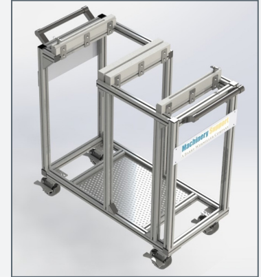
Mighty Max 2